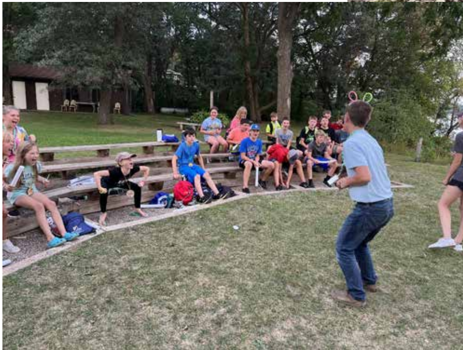
WI 4-H Horse Leadership Conference: 5 Clover Flyer Dispatch