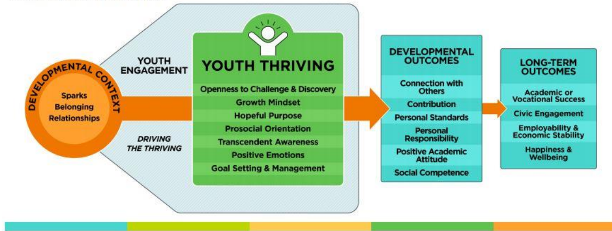
4-H Thriving Model (Arnold, 2018)

Please check your email for more information!