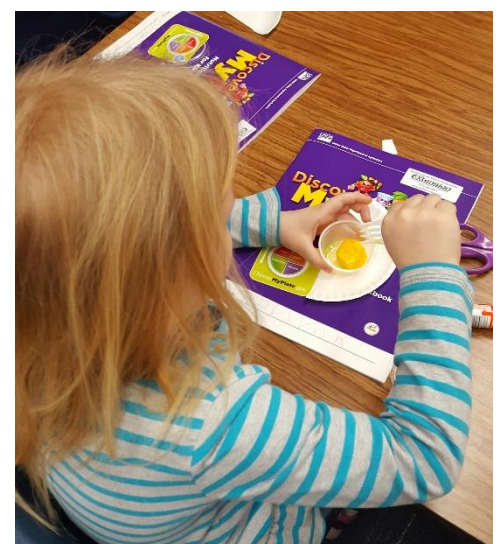
Photos above from Kindergarten Nutrition Education Lesson: Beginning letters of fruits, shopping for fruits and vegetables activity, trying mango!